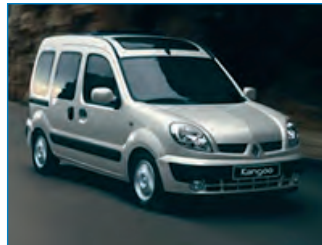
RENAULT KANGOO MOB0380 / 6162