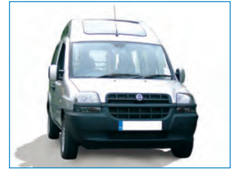
FIAT DOBLO - HIGH ROOF MOB0386 / 6164