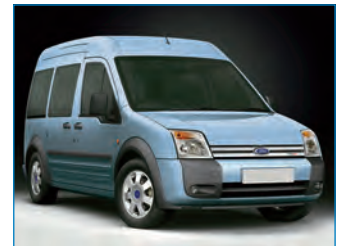
FORD CONNECT TOURNEO MOB0388 / 6166