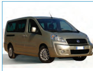
FIAT SCUDO MOB0398 / 6173

Please call sales for the latest updates, or for parts enquiries.