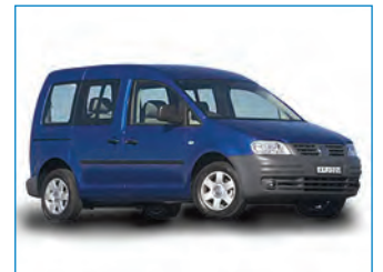
VW CADDY MOB0390 / 6168