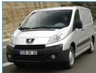
PEUGEOT EXPERT MOB0398 / 6173