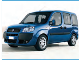
FIAT DOBLO - LOW FLOOR MOB0385 / 6163