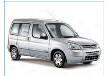
CITROEN BERLINGO MOB0385 / 6163